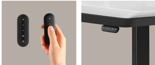
Removable Hand Remote

Stand up and see farther. The AERO lifting conference table has three levels of memory height that can be easily adjusted with one button, which allows for physical and mental stretching, divergent thinking, and more efficient decision-making.